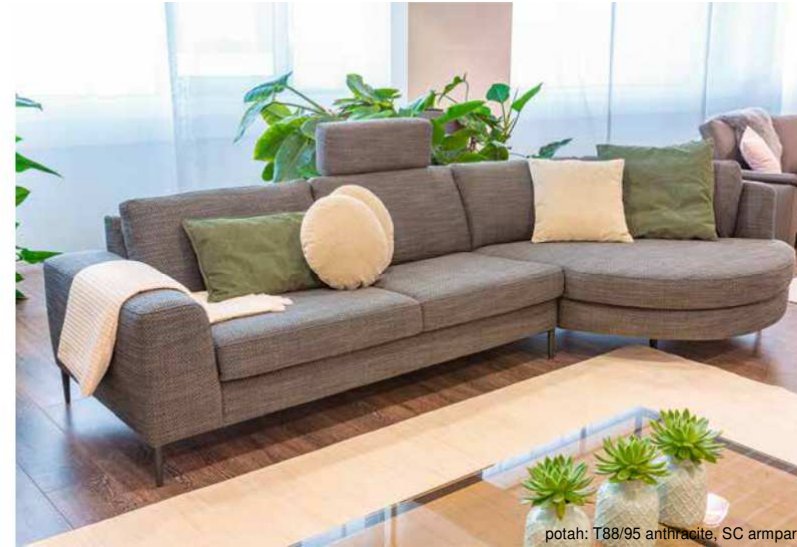
potah: T88/95 anthracite, SC armpart