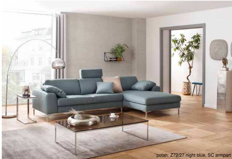
potah: Z72/27 night blue, SC armpart